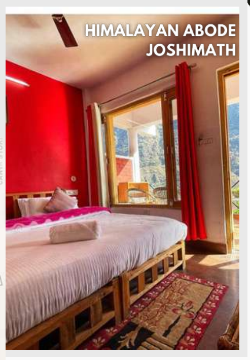
HIMALAYAN ABODE JOSHIMATH